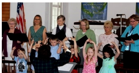
Children's Easter Choir & Ladies' Ensemble