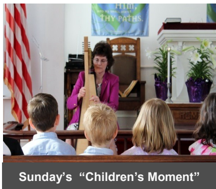
Sunday's "Children's Moment"